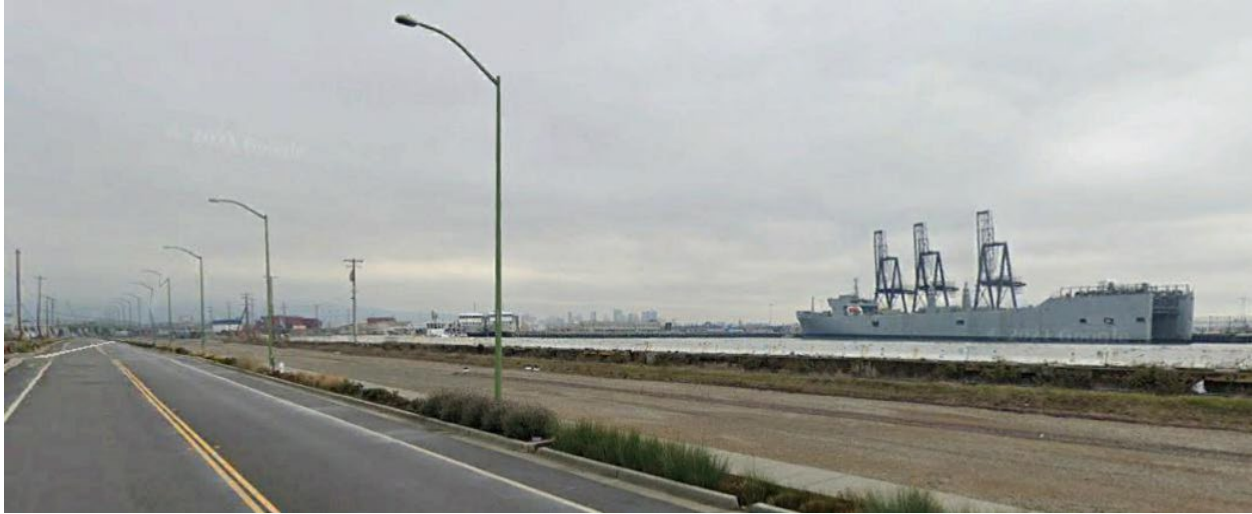
Figure 13: Viewpoint 3

View of tugboats at Berths 8/9, Government Lay berth Vessel at Berths 9 and 20, and the Outer Harbor and Marine Terminals from the Judge John Sutter Shoreline Park Bridge Yard Building and Observation Deck at Burma Road, looking east.