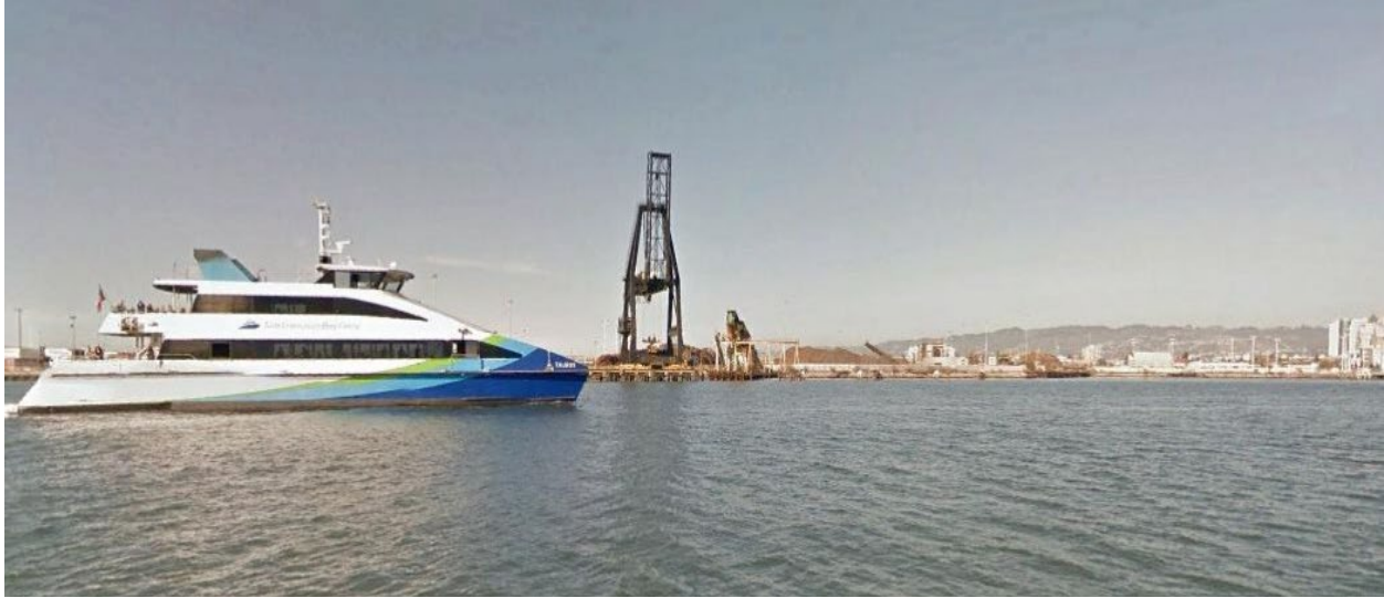
Figure 17: Viewpoint 9

View of Schnitzer Steel Facility with black mechanized crane, northwestern corner of Inner Harbor Turning Basin from the Inner Harbor Channel, looking north.