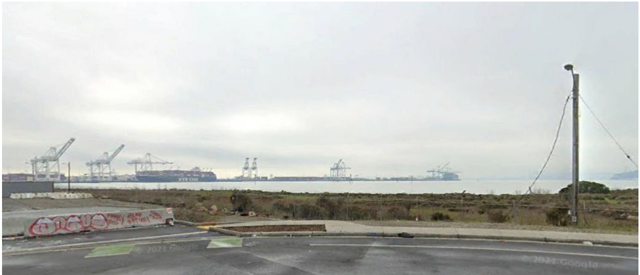
Figure 12: Viewpoint 2

View of the Outer Harbor Turning Basin and Port Marine Terminals from the Judge John Sutter Shoreline Park (Gateway Park) entrance, looking south.