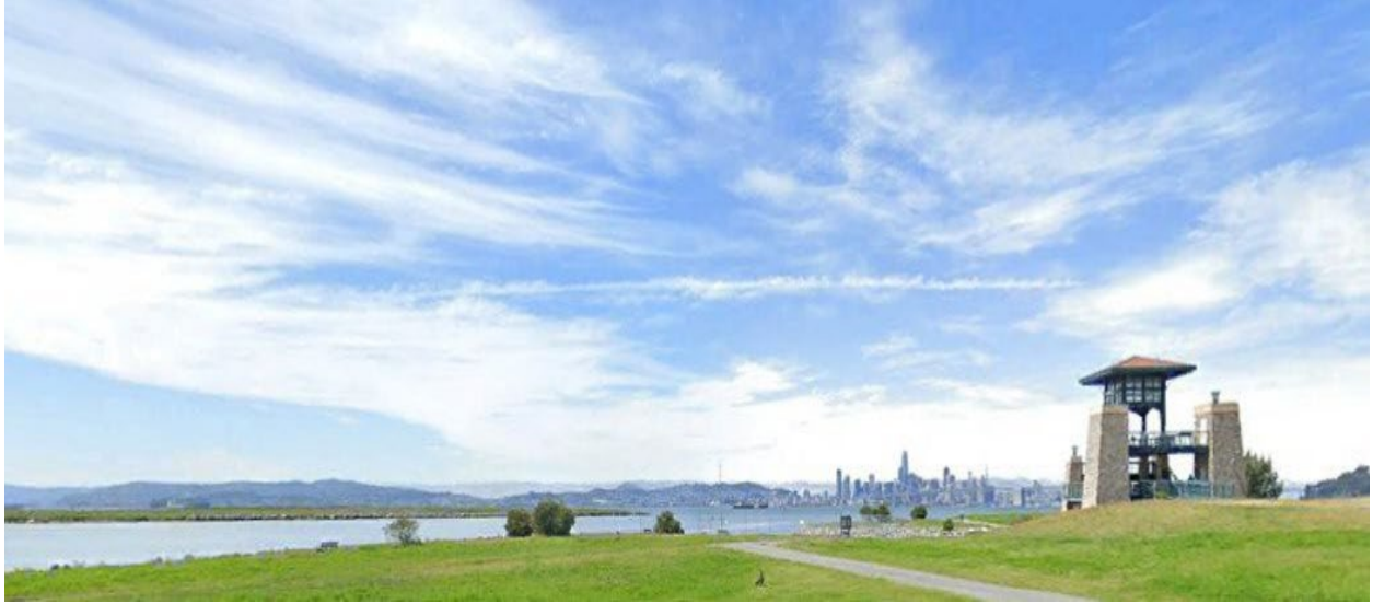
Figure 15: Viewpoint 5

View of the Inner Harbor Entrance, San Francisco Skyline, and Chappell Hayes Observation Tower, from Middle Harbor Shoreline Park, looking southwest.