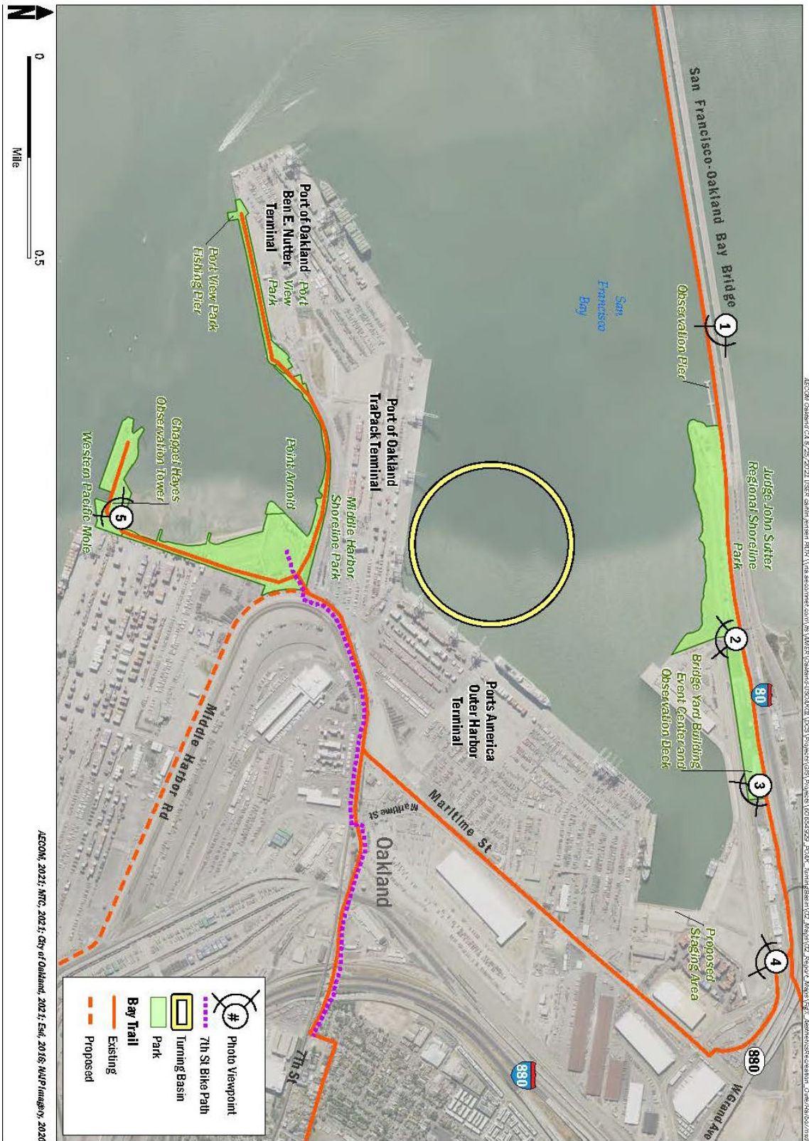
Figure 1: Key Observation Points and Parks, Outer Harbor Turning Basin Study Area