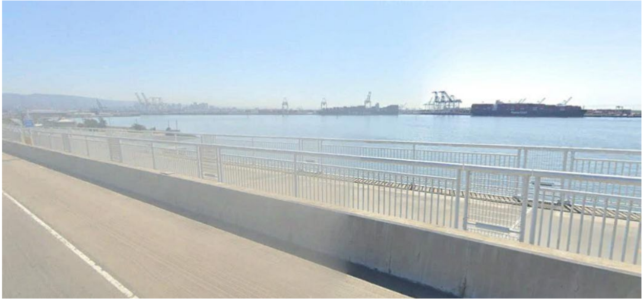
Figure 11: Viewpoint 1

View of the Outer Harbor Turning Basin and Port Marine Terminals from the Bay Bridge and Bay Bridge Trail, looking east.