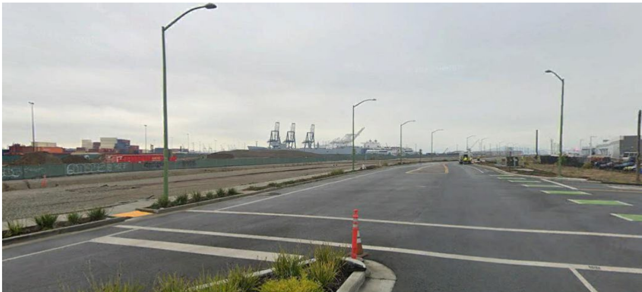
Figure 14: Viewpoint 4

View of shipping containers, soil stockpiles, and the Outer Harbor Marine Terminals from the Bay Trail/Burma Road, looking south.